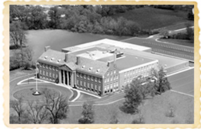
Home Office Building 1975

By Central's 100th anniversary, construction was complete on a major addition to the original Home Office building, almost doubling the total size. Central's assets at the beginning of this centennial year exceeded $150 million, and Central was well positioned for the future.