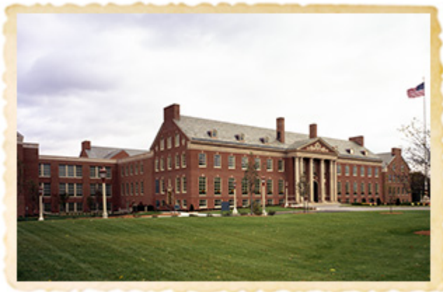
Home Office Building 2007