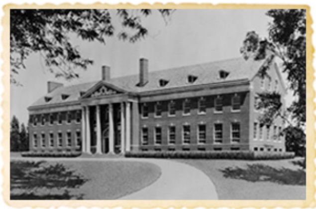
Home Office Building 1931

In 1919, the New York Branch Office was opened as the company's Eastern Department. In 1921, Central joined with 16 other companies to form Improved Risk Mutuals (IRM) offering reinsurance, engineering, and inspection services. In looking for further growth opportunities, Central turned its attention north to Canada, with Ontario being the first Canadian province to license Central Manufacturers' Mutual.