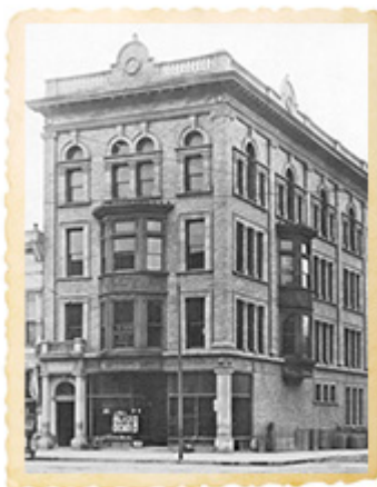
Central's Office 1906-1931

Central's operation soon stretched far beyond Van Wert, first to a statewide organization, then interstate beginning in 1883. The company's name was far too limiting, so in 1884, the Van Wert County Mutual Fire Insurance Company became The Central Manufacturers' Mutual Insurance Company. It was also at this time that a permanent safety fund was established, continued today as the Policyholders' Security Fund.